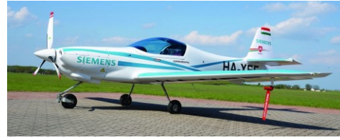
Fig. 3. Siemens Magnus eFusion (Magnus,2017)

Second aircraft is the Siemens Magnus eFusion (fig.3.) two seater light sport aircraft. It uses a 60kW Siemens electric propulsion system. Its empty weight 450 kg and maximum take-off weight is 600kg. The endurance is about 15'.