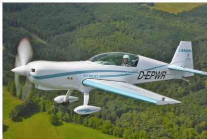
Fig. 2. Siemens Extra 330LE (Extra, 2017)

First one is the Siemens Extra 330LE aircraft (fig.2.), which is a fully electric variant of the famous Extra 300 aerobatic family. The aircraft has already set up 3 world record. It is powered by a 260kW Siemens electric engine. The electric motor weighs 50kg. Its maximum take-off weight is 1000kg, almost the same to the piston engine version. It is important to mention that the manufacturer used the same airframe, with same, or nearly same limitations, that were certified in a piston engine version. Therefore it can carry a limited weight as battery, despite of the weight loss of the engine. The limited amount of battery results in 18.6 kWh capacity. Using this battery pack, the endurance of the aircraft is 15-20 minutes.