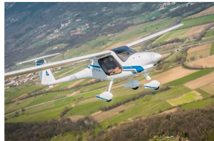
Fig. 4. Pipistrel Alpha Electro (Pipistrel, 2017)

The third is Pipistrel Alpha Electro (fig.4.), which is the electric variant of the ultra-light, two seated Pipistrel Alpha Trainer aircraft. It has a 550kg maximum take-off mass, 350 kg empty mass and carries 126 kg battery packs with 20 kWh usable capacity. This capacity lets it able to fly up to 60 minutes endurance according to the manufacturer. Published user experiences report the endurance significantly less, depending on the used flight profile.